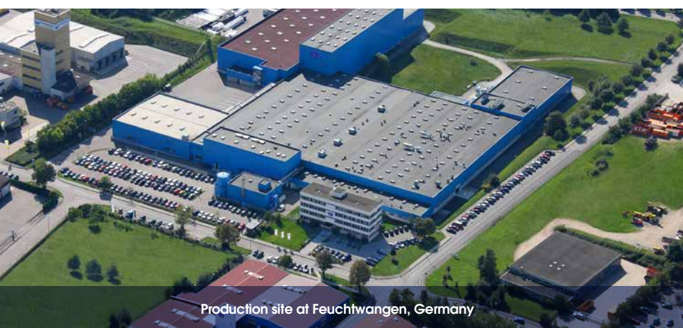
Production site at Feuchtwangen, Germany

We focus on innovation and maintain our own R&D department. Our specialists are our guarantee for constant development of our products and technologies. You can rely on our dedicated support in finding the best packaging solution for your products – from the idea up to the implementation in your packaging process.