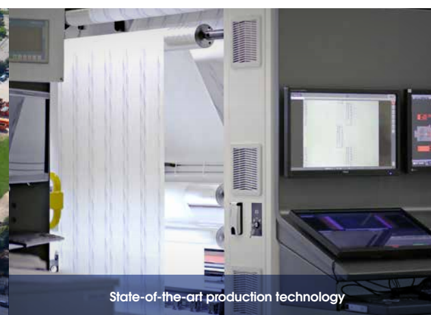
State-of-the-art production technology